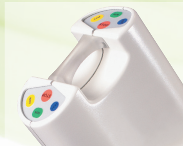
Simple clear function