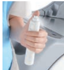
Wireless hand switch

A wireless hand switch or IR remote controller allows you to perform exposures remotely for even more ease-of-use.