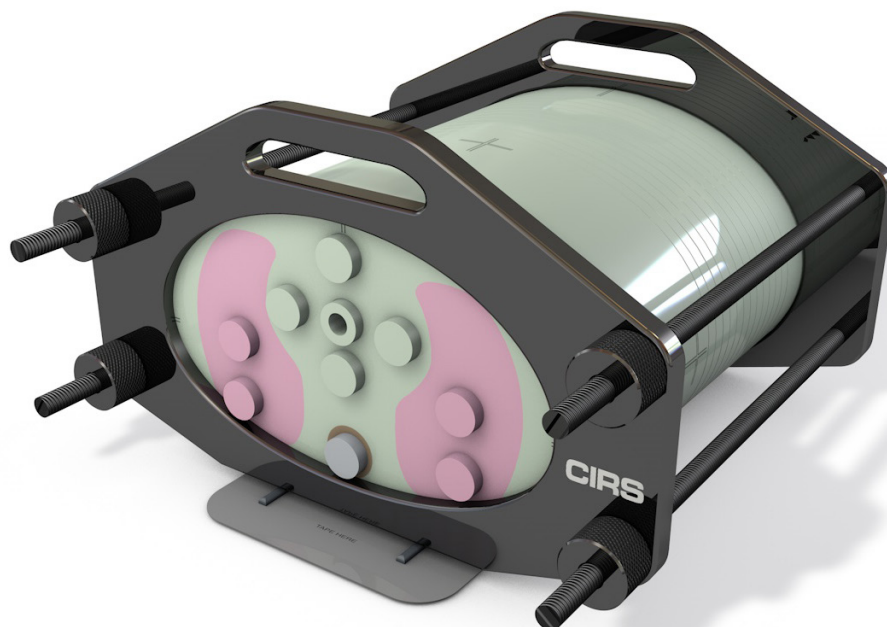
Model 002LFC showing optional water equivalent rod with ion cavity